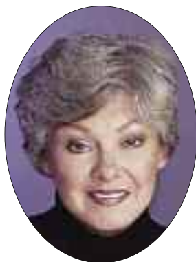
Special Guest Speaker The Honourable Donna H. Cansfield Minister of Natural Resources

Thursday, March 13, 2008 at 9:00 a.m. at the Toronto Sportsmen's Show, Direct Energy Centre, in Salon 105 Exhibition Place, 100 Princes' Blvd., Toronto, Ontario